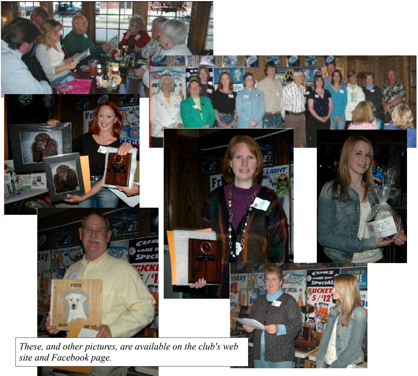
These, and other pictures, are available on the club's web site and Facebook page.