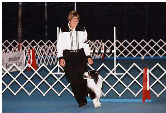
The Obedience Ring

We truly appreciate your help. Without your kindness the raffle doesn't exist. To those of you that have already handed in your donations, THANK YOU.