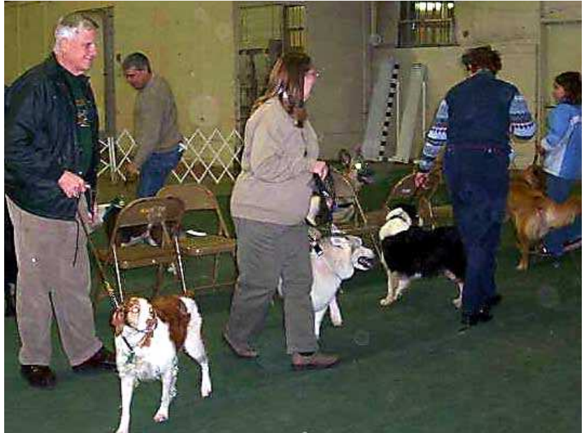
The dogs were never at a loss for a place to sit, but not all their human friends were as lucky in this game of musical chairs at the FVDTC's annual holiday party.