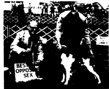
This is Princess, the Spencer's Brittany, also mentioned in the profile.