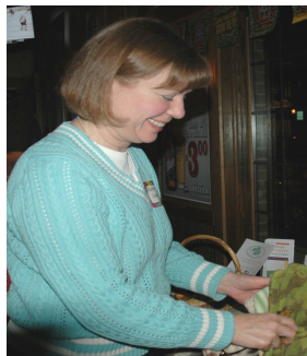
Below: Scenes from Dinner