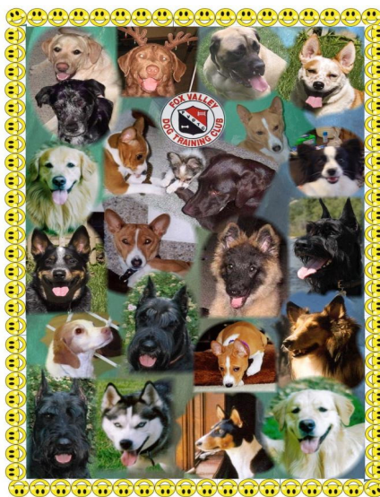
Look at all those smiling happy Fox Valley Dog Training Dogs!