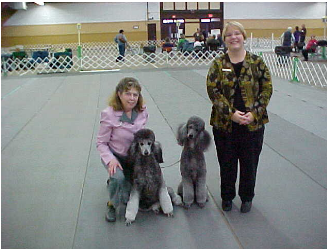
Terrifick Slvr Tantalate RN & Terrifick Platine' RN

Terrifick Standard Poodles - Terri Sidell - 630-543-8403